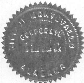
Rusty Nix, Mayor City of Montevallo

IN WITNESS WHEREOF , I have hereunto set my hand and caused this seal to be affixed this 27 th day of January 2025.