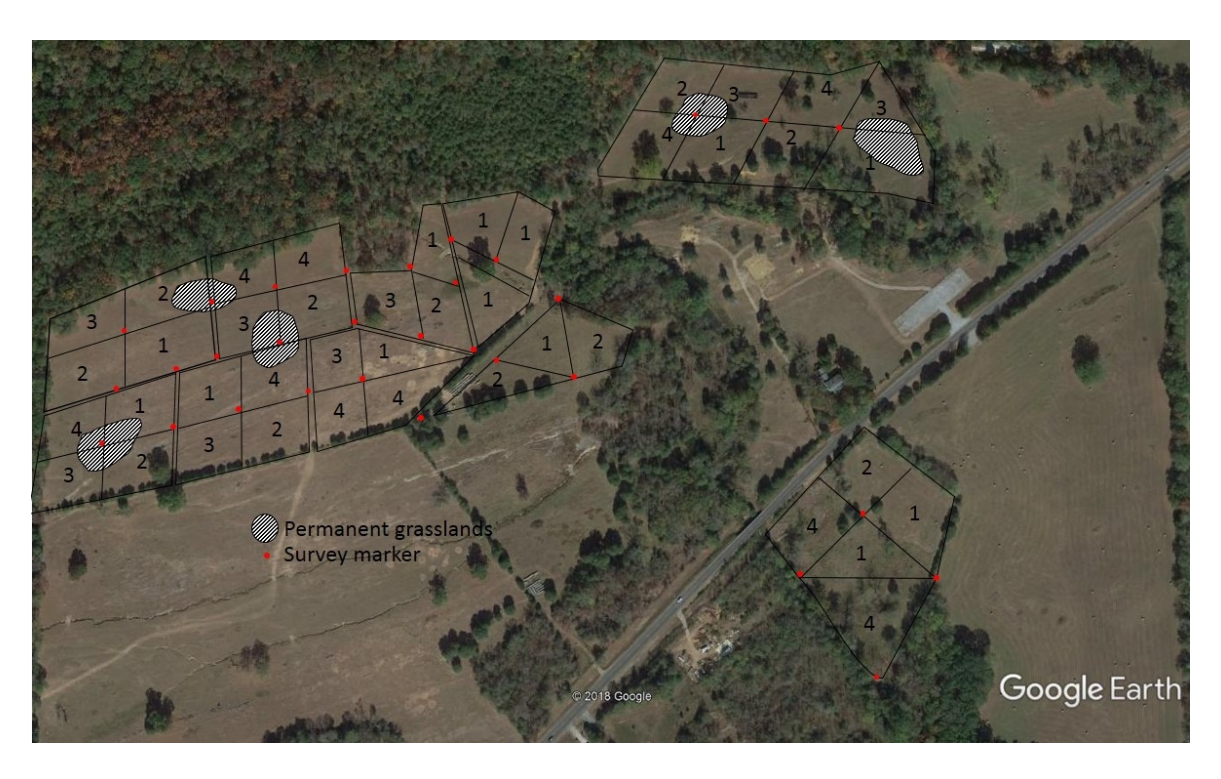
Figure 3. A hypothetical management template for Shoal Creek Park North and Northwest Pastures. The numbered plots would be management units, which would be disturbed in accordance with the schedule given below. (The trail system is notional.)