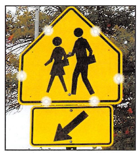
School Crossing (S1-1)