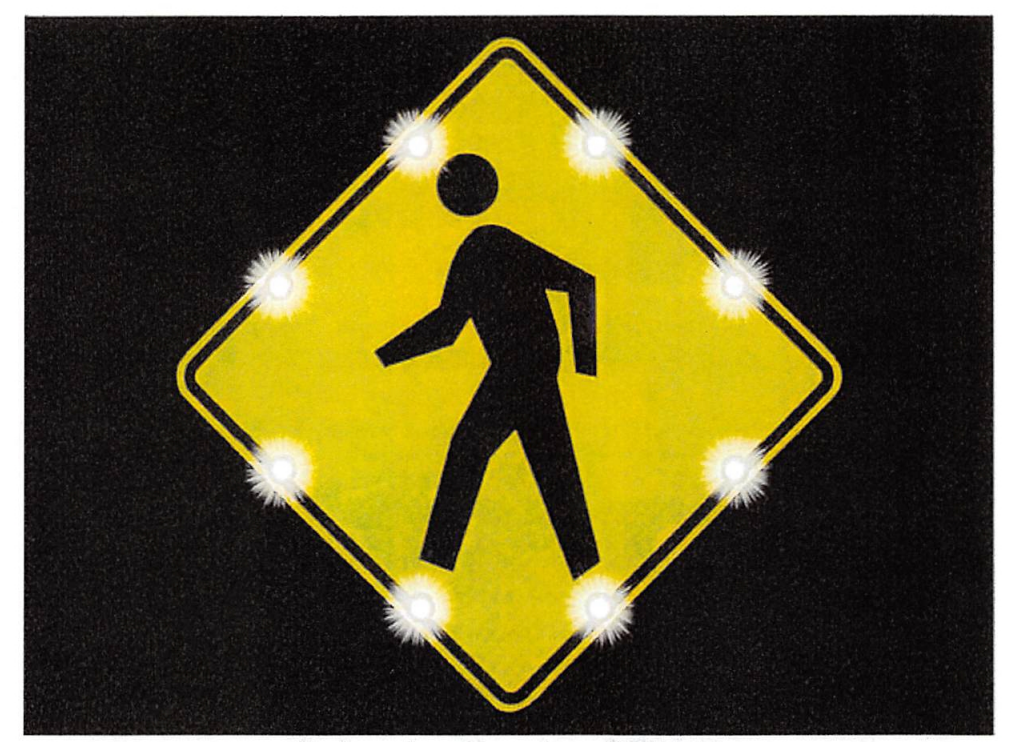
Pedestrian Crossing (W11-2)